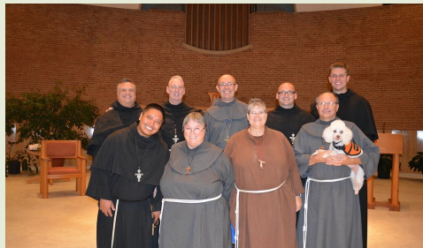
A celebration of community, an experience of growth!

The Franciscan Community of Mercy, a religious Order that is part of the American National Catholic Church, is a dynamic collection of men and women across the United States who seek to live in the footsteps of Christ as modeled in the way of St. Francis of Assisi. We often describe our Order as "religious life re-envisioned" because we live out our Franciscan vocation in ways that reflect our unique skills and way of life. Yes, you can be married or non-ordained, a man, or a woman, and still fully embrace the Franciscan vocation. We